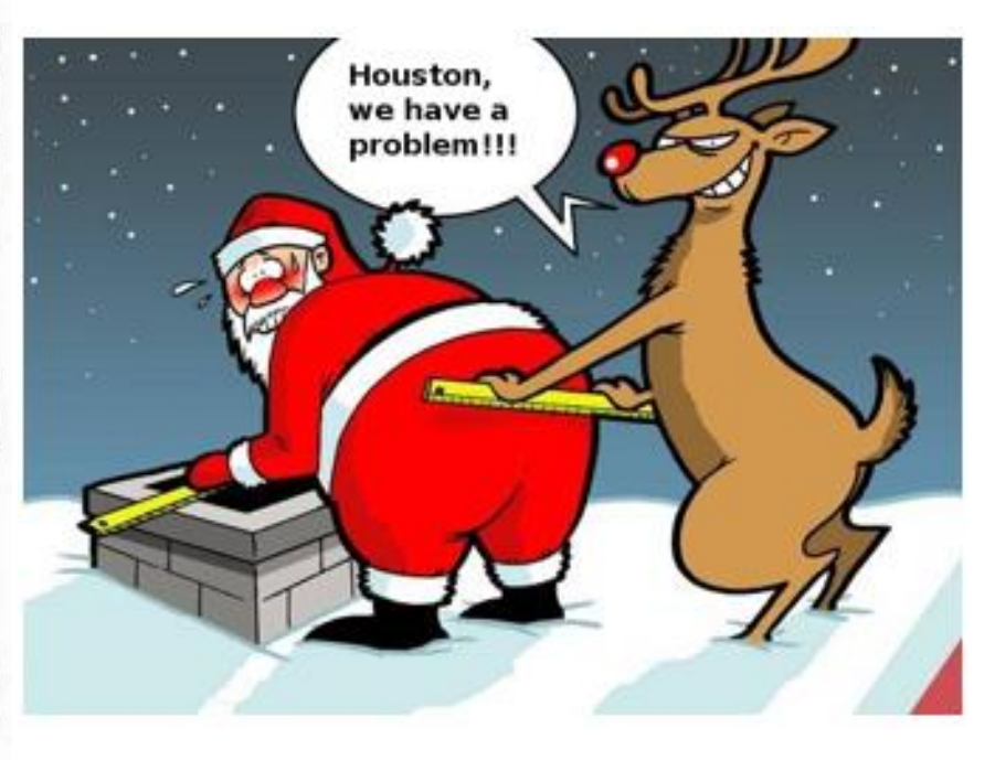
The first senior moment.